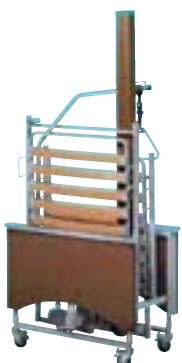
Transport system for domiflex 185

Electrical adjustment of the lying surface including the automatic triple knee break action.