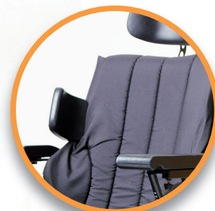
New side supports

The Emineo gives you options you won't find with other wheelchairs. Active driving position, stable sitting position for activity, or resting position when you want a break. The unique tilt function can be used by either the user or the caretaker.