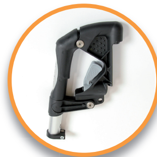
New leg supports