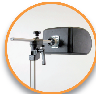
New head and neck support system