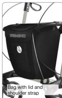
Bag with lid and shoulder strap