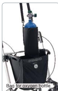
Bag for oxygen bottle