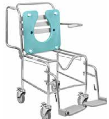
Removable seat. Juvo registered Klipps system