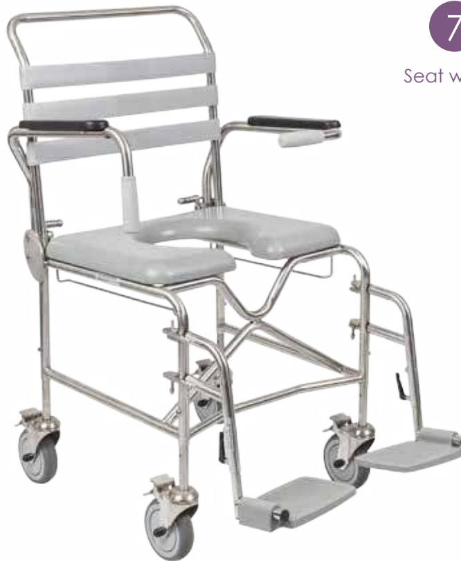
Bariatric model shown