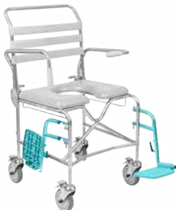
Swing-away, "TearSafe", Juvo registered design footrests