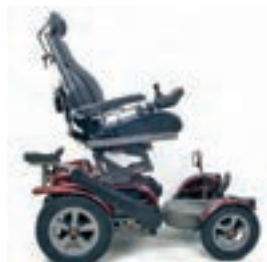
Seat lift 200 mm