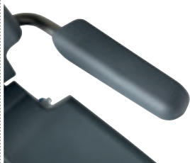
Armrests with soft padding