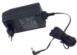
Mains charger unit BC-PT with Euro plug

Accessories for LIFTKAR PT stairclimbers are specifically designed to cater for the individual needs and requirements of people with walking difficulties. The quality of the technical solution and design are of the utmost importance.