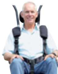
Range of belt systems

standard width 44 cm, extended to 54 cm Art. No. 945 146