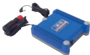
In-car charger unit BC 10-30 VDC-PT

weight 4.3 kg, capacity 5.2 Ah, voltage 24 VDC Art. No. 004 150