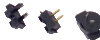
Charger unit adapter

5-point belt system, Art. No. 945 144 / Waist belt, Art. No. 945 118 / Waist/chest belt, Art. No. 945 158