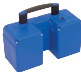
Quick-change battery unit BU PT 5,2 Ah

weight 4.3 kg, capacity 5.2 Ah, voltage 24 VDC Art. No. 004 150