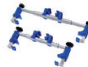
Retention clamp for PT Uni

UK plug, Art. No. 045 142 / USA plug, Art. No. 045 143 AUS plug, Art. No. 045 144