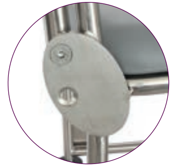
Serial number and SWL etched on every model for product identification