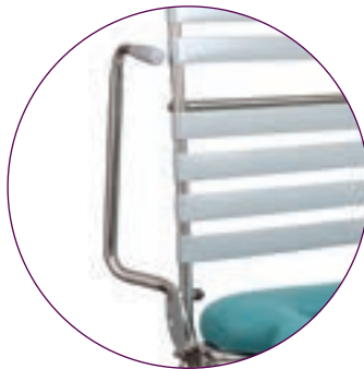
Swing-away arms to assist in side transfer & patient access, height adjustable