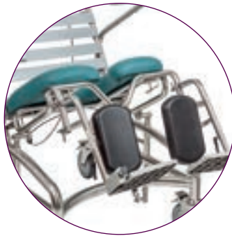
Fully adjustable seat tilt to assist with client positioning