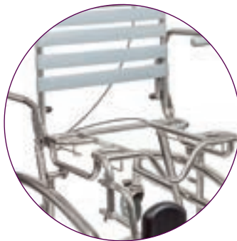
Three side cut-out seat frame design for easy cleaning, allowing for left, right and front cut-out seats without modification.