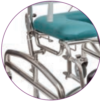
Adjustable seat height for improved client positioning. Six settings at 26mm increments