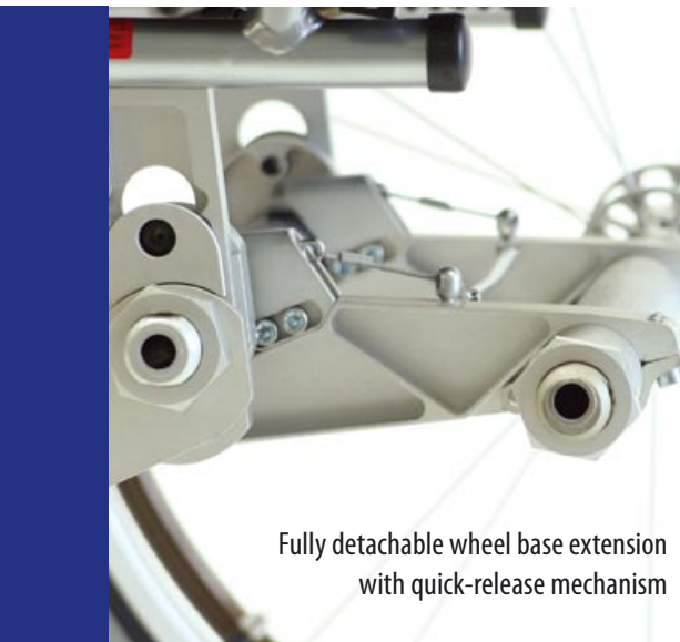
Fully detachable wheel base extension with quick-release mechanism