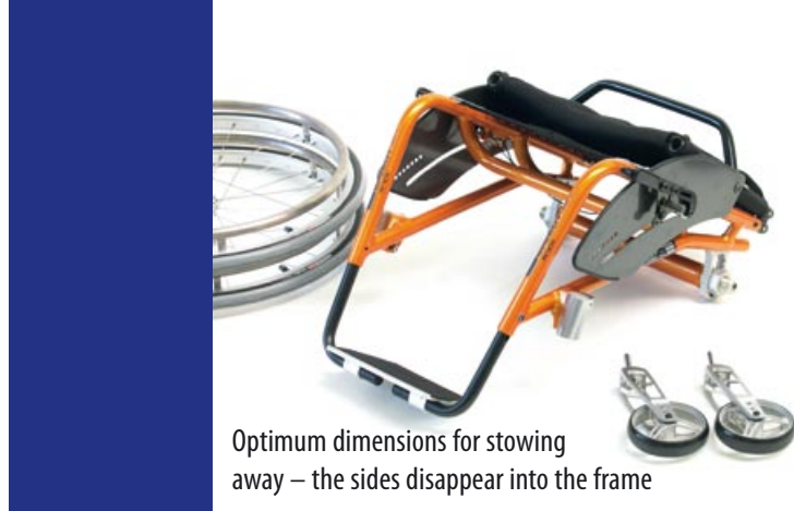
Optimum dimensions for stowing away – the sides disappear into the frame