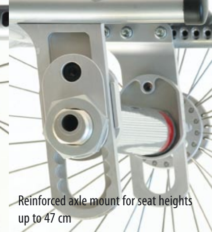
Reinforced axle mount for seat heights up to 47 cm