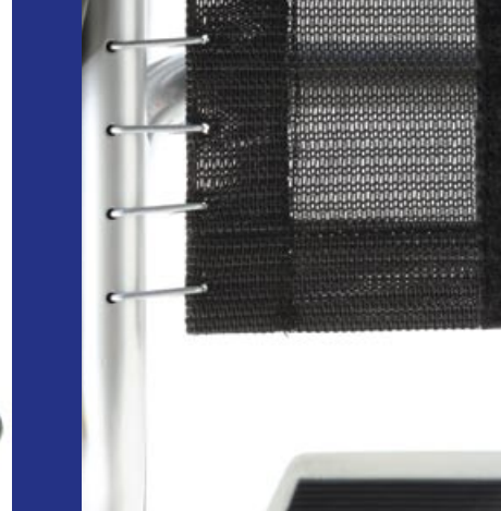
Body Contour – elastic, breathable seat covering available in the same 1 cm increments as the frame width